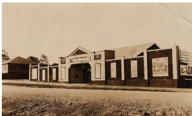
Bon Accord Theatre