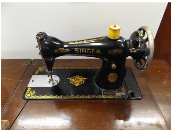
Treadle Singer Sewing Machine 1938 No. EB 818191