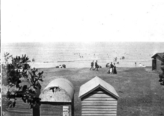
Bathing boxes at Sandgate 1917