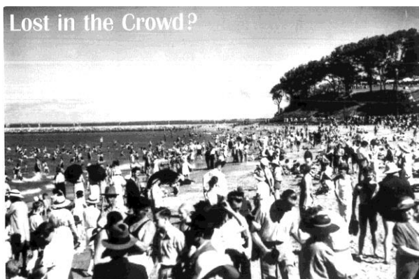
‘ Lost in the Crowd’ Shorncliffe 1935