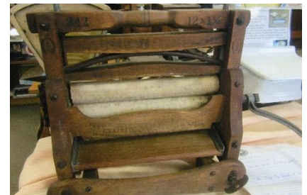
Mangle on display in Museum