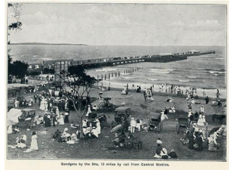
Sandgate by the Sea, 12 miles by rail from Central Station.

Among those passers-by were undoubtedly some of the many holidaymakers who descended on the area in their thousands. The Telegraph tells us that on 27 December 1897 “about 3000 persons went down by train in the morning”. Spare a thought for the railway workers. The revellers congregated at Moora Park and along Flinders Parade. “Demand for refreshments”, said the paper, “appeared to be brisk”. No doubt the pubs did a roaring trade.