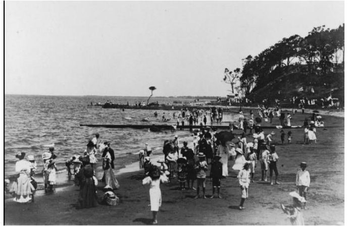
New Year's Day crowd at Sandgate 1907