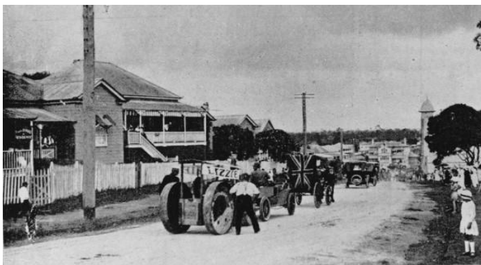
Patriotic carnival at Sandgate, New Year's Day 1918

A more culinary celebration was planned in 1912, when a "grand picnic supper", advertised as "Ye Olde English Feast", was to be offered to the "many city and suburban people who spend their New Year's Eve at Sandgate". This repast would involve "the roasting of an ox". Also on offer were "open-air amusements, [a] promenade concert, and music and village dances", the festivities to be illuminated by "400 coloured and fairy lamps".